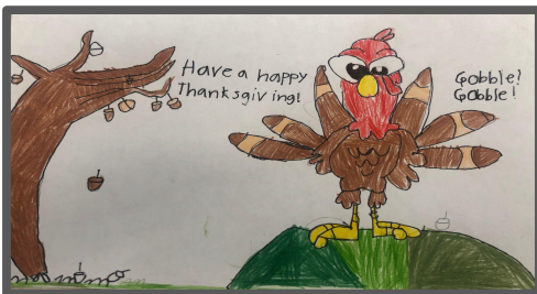
Grade 2 students made placemats for the Salvation Army's Thanksgiving Feast.