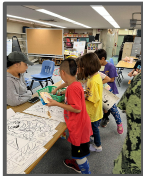
Shopping at Kuhio Mart with 'Io Bucks